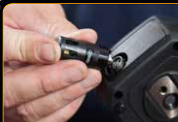
Field Replaceable T/RH Sensor