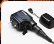
MR05 Impact Probe