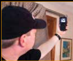
Scan for Targets