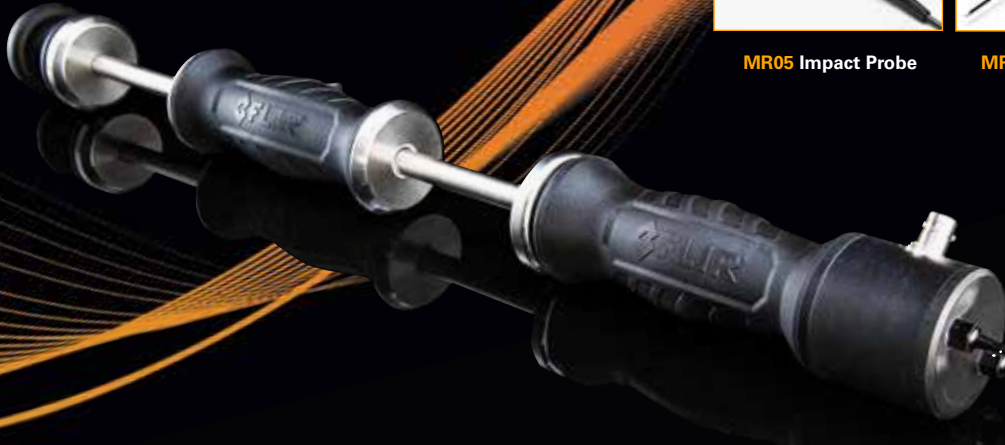
MR08 Hammer/Wall Probe Combo