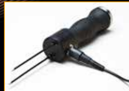
MR06 Wall Cavity Probe