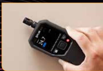
Pin or Pinless Measurements