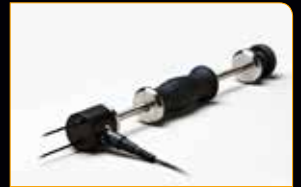
MR07 Hammer Probe