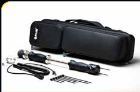
MR08 Hammer/Wall Probe Combo complete with pins and case