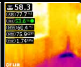
Corner moisture: Iron