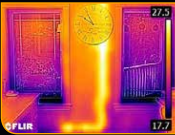
Pipe in wall Thermal Image with MSX