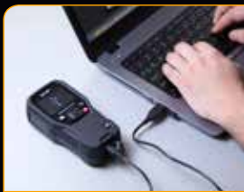
Transfer Images via USB

For more information please visit www.flir.com/MR160